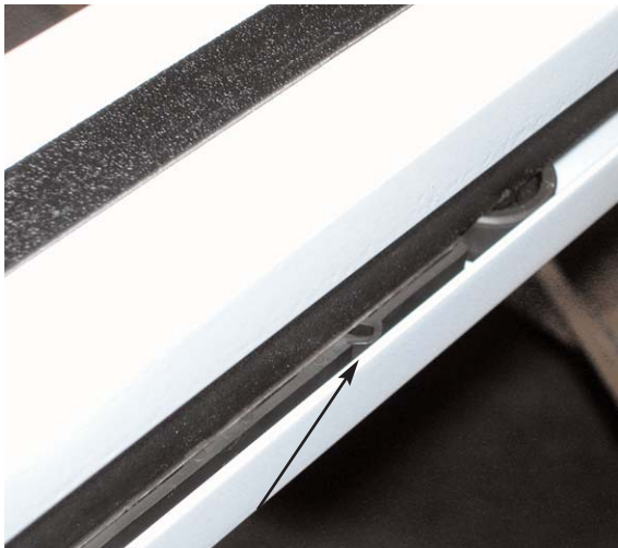
108 LX Oil Groove

The slides (image below) and the inner post surfaces are lubricated at the factory. When the lubricant on the inner surfaces of the post accumulates dust and/or dries out, a thick tar like substance can form that causes the machine to feel STICKY which may increase the resistance to slide freely. When this occurs the machine can be made to run like brand new by cleaning the inner tracks.